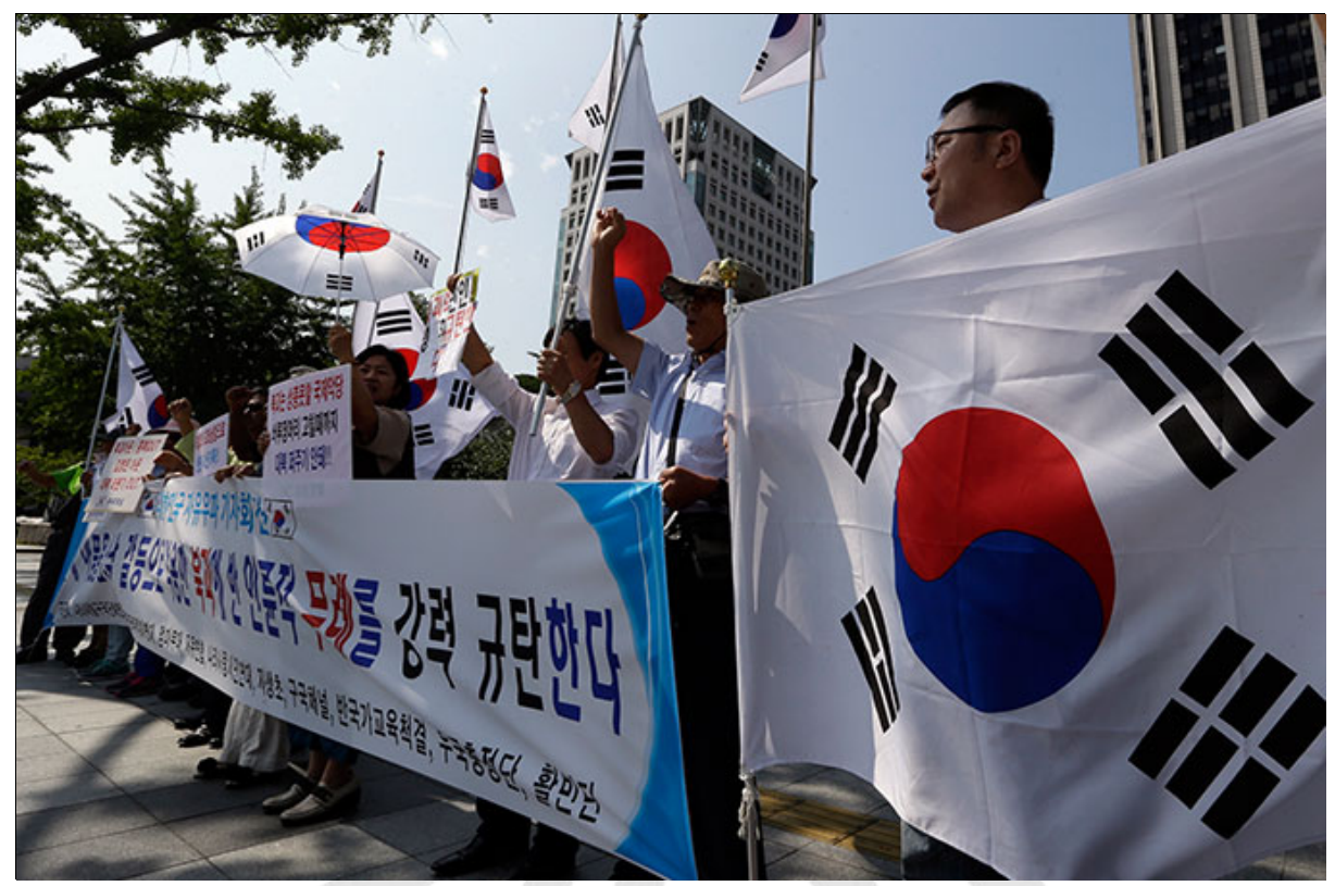
South Korean protesters shout slogans as they hold national flags during a press conference against abrupt cancellation by North Korea of planned reunions for families separated by the Korean War in front of the government complex in Seoul