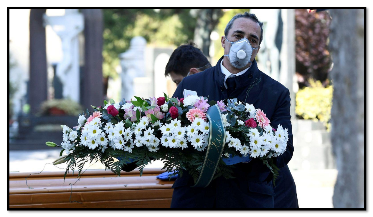
Italy experienced its largest daily increase in coronavirus deaths March 18

Between Trumpism of the late 2020s and Thatcherism and Reaganism of the 1980s, one can visualize the transformation of Neoliberalism as catchall for anything that smacks of deregulation, liberalization, privatization, or fiscal austerity. Neoliberalism has derived from several notions, which are supposedly grounded in the concept of homo economicus , the perfectly rational human being, found in many economic theories, who always pursues his own self-interest. (22) The term had existed in French "néo-libéralisme", and appeared in 1898 in the works of the French economist Charles Gide to describe the economic beliefs of the Italian economist Maffeo Pantaleoni. 'Neoliberalism' also gained momentum in an international intellectual gathering, "Colloque Walter Lippmann" (the Walter Lippmann Colloquium), convened by French philosopher Louis Rougier in Paris in 1938. Lippman was an American journalist who wrote a well-read book "An Enquiry into the Principles of the Good Society" in 1937. The Colloquium's objective was to construct a new liberalism as a rejection of collectivism, socialism, and laissez-faire liberalism. It defined 'neoliberalism' as involving the priority of "the price mechanism, free enterprise, the system of competition, and a strong and impartial state." (23)