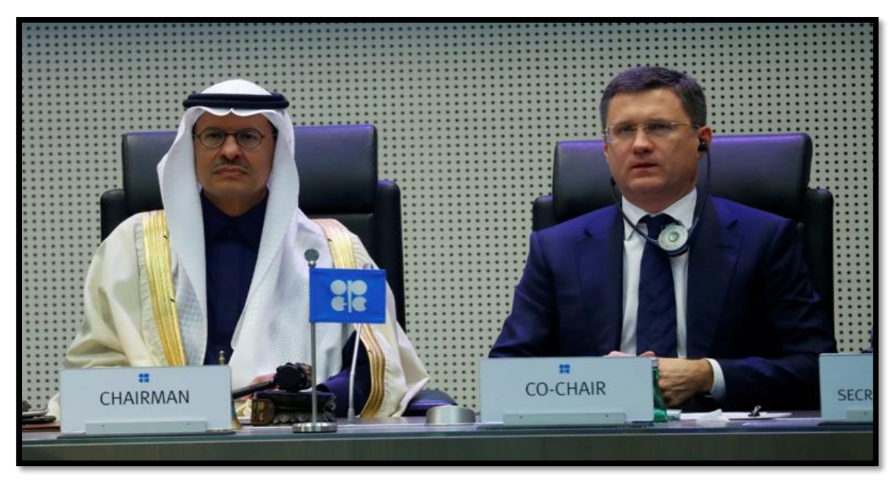
Saudi Minister of Energy Prince Abdulaziz bin Salman Al-Saud and his Russian counterpart Alexander Novak are seen at an OPEC and NON-OPEC meeting in Austria Dec 6, 2019

There are outstanding issues between Moscow and Riyadh over a reasonable oil production cut. Saudi Arabia, the cartel's leader, suggested the participants collectively cut their oil production by about 1 million barrels per day. However, Russia, wary of the plan, stopped at around 500,000 barrels a day. The Kremlin is said to be favoring keeping oil prices at a low level, which would "hurt the American shale oil industry or is gearing up to seize a bigger sliver of Asian and global oil demand for itself." Emma Ashford, an expert on petrostates at the CATO Institute in Washington explains, "the Russians are more worried about market share and think they'd do better compete with the Saudis rather than cooperating at this point." (10) Russia's strategy has not settled well with the Saudis, who decided the slash their oil exports further in early March to wage a price war with Russia. the price per barrel went down by about $11 to $35 a barrel — the biggest one-day drop since 1991.