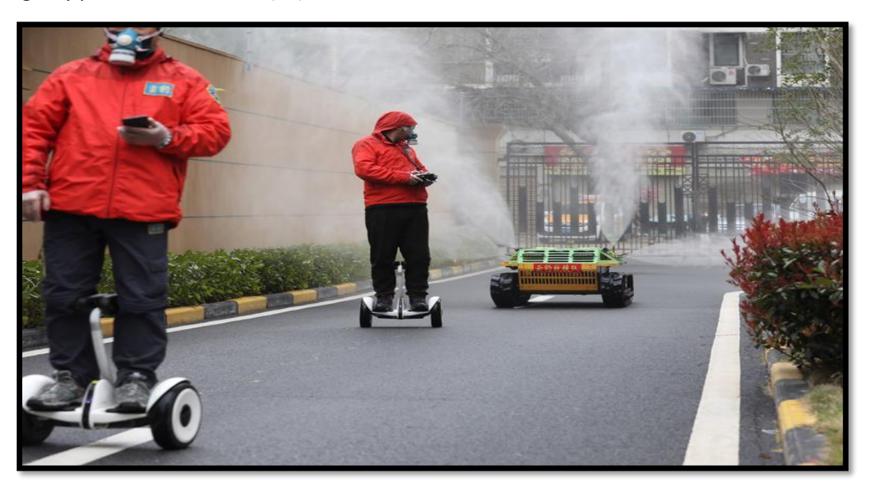
Workers ride smart self-balancing scooters as they control a robotic sprayer spraying disinfectant at a residential compound in Wuhan, China

By mid-March, China was claiming victory. "Mass quarantines, a halt to travel, and a complete shutdown of most daily life nationwide were credited with having stemmed the tide", and "China's signature strength, efficiency and speed in this fight has been widely acclaimed", declared China's Foreign Ministry spokesman Zhao Lijian. (18) One of the op-eds published by China's state-run Xinhua news agency emphasized that China has adopted the "most comprehensive, most strict and most thorough preventative measures" to combat the pandemic. With a nationalist tone, the People's Daily boasted that, "China can pull together the imagination and courage needed to handle the virus, while the US struggles." Chinese officials seized the European and American Coronavirus stress to regularly remind a global audience of the superiority of Chinese efforts and criticizing the "irresponsibility and incompetence" of the "so-called political elite in Washington," as the state-run Xinhua news agency put it in an editorial. (19)