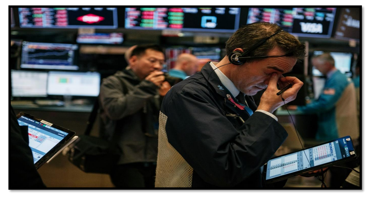
Tense Times at World Financial Markets

capitalist ideology. During his first year in office, President Trump signed the Tax Cuts and Jobs Act, which has lowered corporate tax rate from 35 percent to 21 percent beginning in 2018. The top individual tax rate dropped to 37 percent. Trump's tax plan cut income tax rates, doubled the standard deduction, and eliminated personal exemptions. The corporate cuts are permanent while the individual changes expire at the end of 2025. (6) In the first week of March 2020, leaders of the major Wall Street banks were summoned to the White House to discuss the coronavirus economic fallout. The Trump administration is reported to be considering more corporate tax cuts, toward the airlines and hospitality industries, and a temporary payroll tax cut. Trump's White House is considering requesting the approval of Congress of a $850 billion stimulus package to stabilize an economy, and another $50 billion in direct stimulus to help the airline industry. The White House's plan includes also another $100 billion in funding for programs aimed at providing paid sick leave, food assistance, and other aid to American workers. The total requested Coronavirus financial allocations can top $1 trillion.