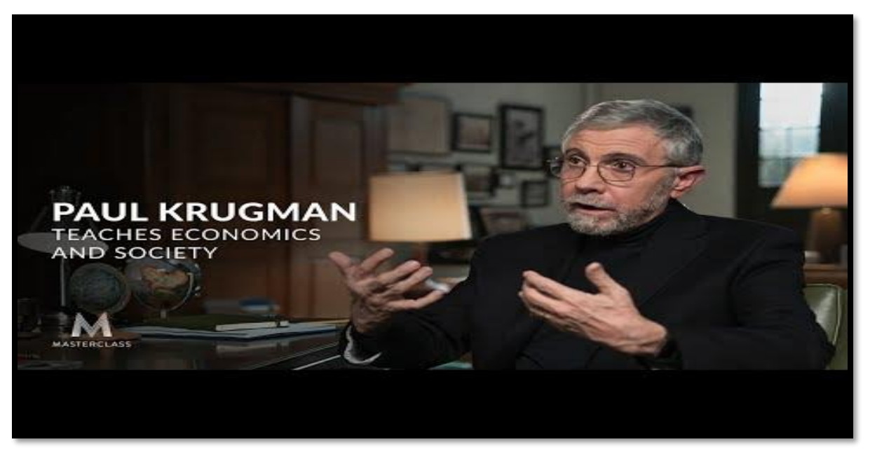
Nobel laureate Paul Krugman teaches a new class Economics and Society online

series of MasterClass lessons "Economics and Society" online with an initial subscription of $15. He aims to teaching individuals the principles that shape political and social issues, including access to health care, the tax debate, globalization, and political polarization. He argues economics is not a set of answers—"it's a way of understanding the world".