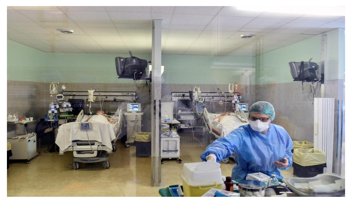
Terrible decisions have to be made when hospitals are overwhelmed in Italy

European economic historians fear some déjà vu memories of the Black Death, which spread in the continent in the mid-14<sup>th</sup> century and led to the death of one third of the population. This reduction of demography caused scarcity of labor, increase in wages, decrease in inequality, and contested the then-feudal system in Europe. It also paved the way for the Industrial Revolution which Industrial Britain was hit by 'King Cholera' in 1831-32, 1848-49, 1854 and 1867. Tuberculosis also was responsible for the death of one-third of the casualties in Britain between 1800 and 1850. This nightmarish refrain comes back now stronger as epidemics have been 'great equalizers', and may initiate long-term implications nor only for European economic growth, but also for the world economy. After the US Federal Reserve decided to slash the benchmark interest rate to between zero and 0.25 percent (down from a range of 1 to 1.25 percent) and to buy $700 billion in Treasury bonds and mortgage-backed securities in a Sunday emergency meeting, the Dow Jones industrial average plunged 2,250 points at the open and trading suspended almost immediately the following day Monday, March 16.