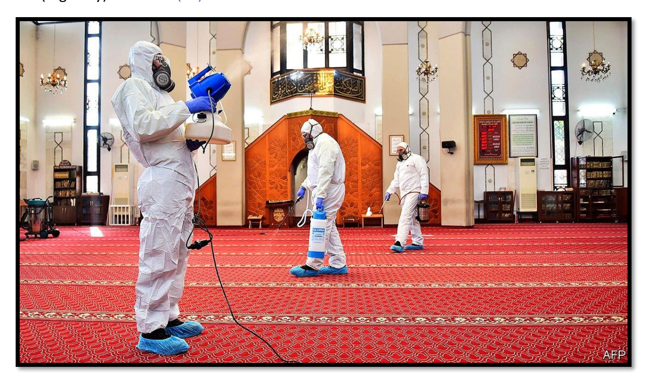
A mosque in Kuwait under a deep sanitizing process

The world's struggle with Coronavirus can be a reflective and defining moment in modern history. Do we have a public health safety net? How the have-nots are coping with Coronavirus? Do we have an epidemic deterrence strategy since Great Powers have gone to extremes to develop their nuclear deterrence capabilities since World War II? In the fight against Coronavirus, Americans too are currently becoming collateral damage. The Trump administration is reported to be "particularly ill-prepared for such an undertaking. Not only were they distrustful of elite warnings, thanks to decades of conservative attacks on the American intellectual establishment, but the president was personally unwilling to believe news that might be politically damaging and surrounded by a staff too scared or too incompetent to convince him otherwise. They ignored the advice of public health experts warning them to ramp up testing, ignored warnings from doctors on the ground that things were getting bad, and failed to tell Americans that social distancing was necessary before it was (arguably) too late." (52)