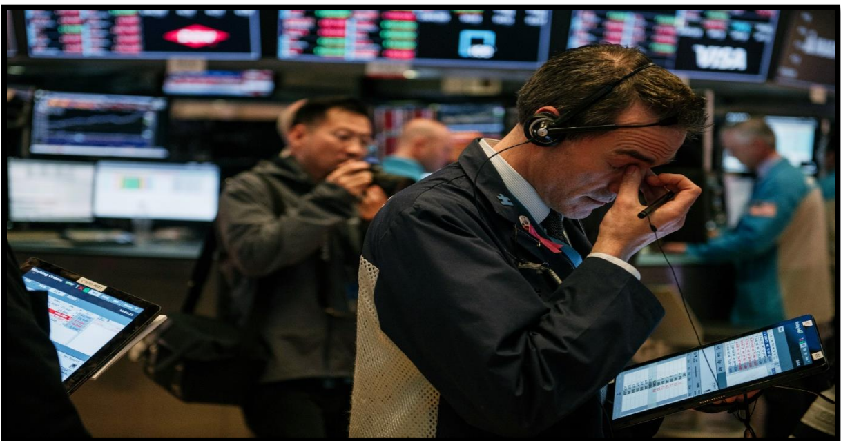
Tense Times at World Financial Markets

capitalist ideology. During his first year in office, President Trump signed the Tax Cuts and Jobs Act, which has lowered corporate tax rate from 35 percent to 21 percent beginning in 2018. The top individual tax rate dropped to 37 percent. Trump's tax plan cut income tax rates, doubled the standard deduction, and eliminated personal exemptions. The corporate cuts are permanent while the individual changes expire at the end of 2025. (6) In the first week of March 2020, leaders of the major Wall Street banks were summoned to the White House to discuss the coronavirus economic fallout. The Trump administration is reported to be considering more corporate tax cuts, toward the airlines and hospitality industries, and a temporary payroll tax cut. Trump's White House is considering requesting the approval of Congress of a $850 billion stimulus package to stabilize an economy, and another $50 billion in direct stimulus to help the airline industry. The White House's plan includes also another $100 billion in funding for programs aimed at providing paid sick leave, food assistance, and other aid to American workers. The total requested Coronavirus financial allocations can top $1 trillion.