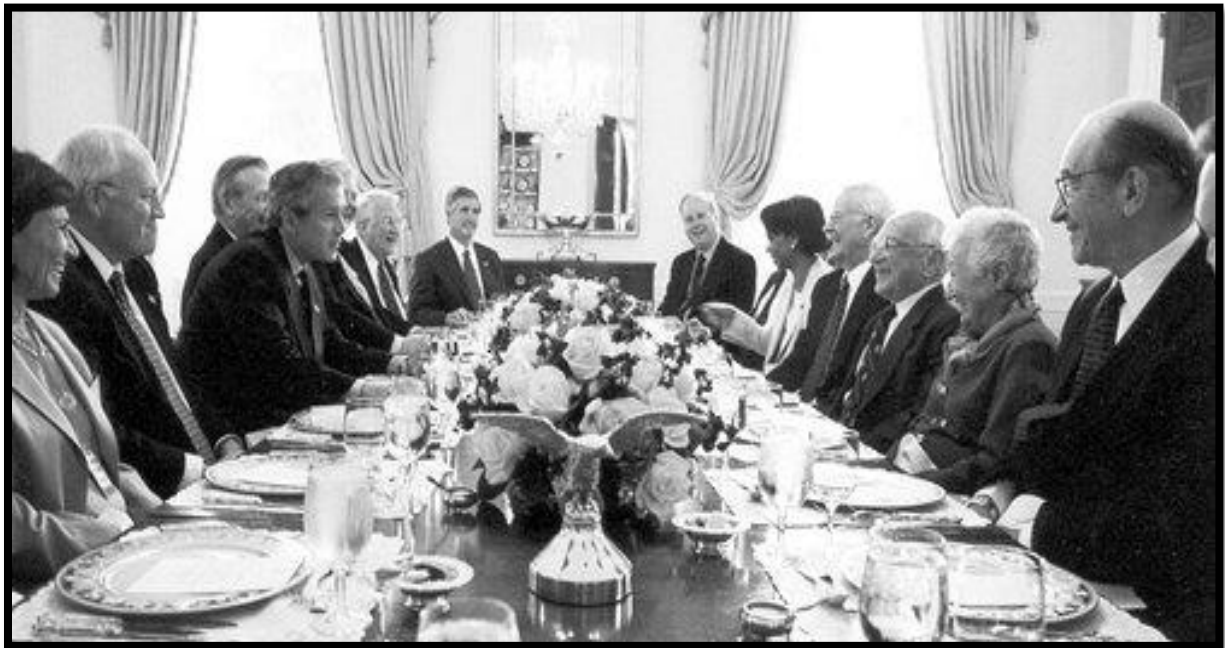
Milton Friedman meeting with President George W. Bush and his advisors

for use.”(24) He also contested what he deemed as waning collectivism, in a subtle reference to socialism and other forms of social democracy; “collectivism is likely to prove far more difficult to reverse or change fundamentally than laissez-faire, especially if it goes so far as to undermine the essentials of political democracy. And this trend, which would be present in any event, is certain to be radically accelerated by the cold war, let alone by the more dreadful alternative of a full-scale war. But if these obstacles can be overcome, neo-liberalism offers a real hope of a better future, a hope that is already a strong cross-current of opinion and that is capable of capturing the enthusiasm of men of good-will everywhere, and thereby becoming the major current of opinion.” (25)