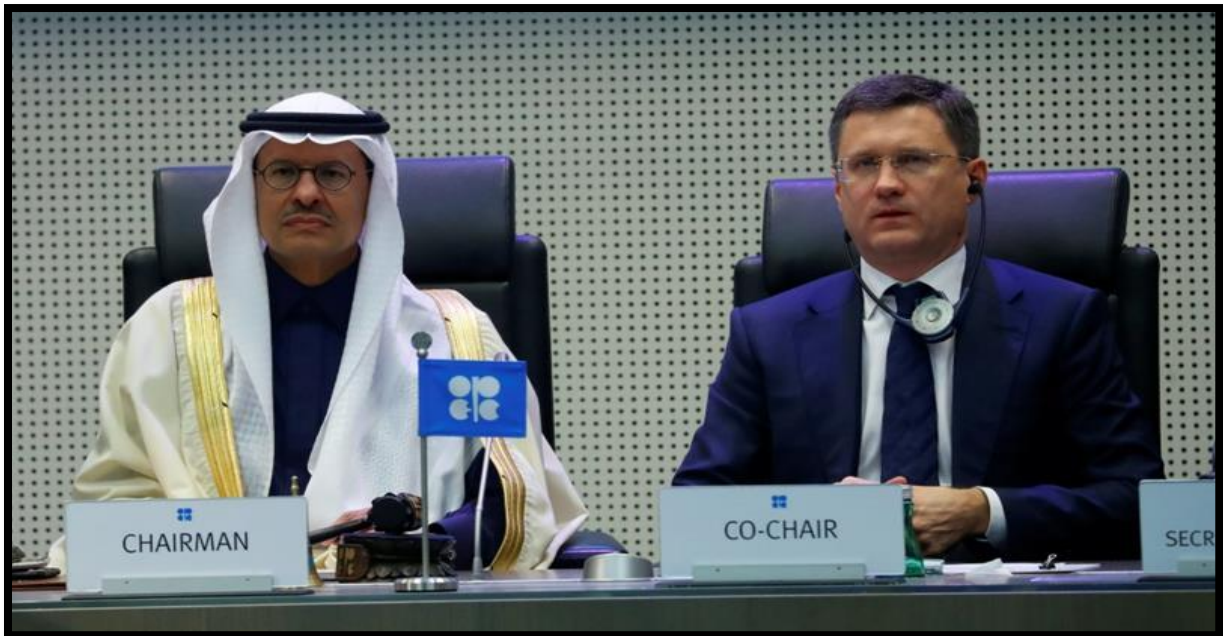
Saudi Minister of Energy Prince Abdulaziz bin Salman Al-Saud and his Russian counterpart Alexander Novak are seen at an OPEC and NON-OPEC meeting in Austria Dec 6, 2019

There are outstanding issues between Moscow and Riyadh over a reasonable oil production cut. Saudi Arabia, the cartel's leader, suggested the participants collectively cut their oil production by about 1 million barrels per day. However, Russia, wary of the plan, stopped at around 500,000 barrels a day. The Kremlin is said to be favoring keeping oil prices at a low level, which would "hurt the American shale oil industry or is gearing up to seize a bigger sliver of Asian and global oil demand for itself." Emma Ashford, an expert on petrostates at the CATO Institute in Washington explains, "the Russians are more worried about market share and think they'd do better compete with the Saudis rather than cooperating at this point." (10) Russia's strategy has not settled well with the Saudis, who decided to slash their oil exports further in early March to wage a price war with Russia. The price per barrel went down by about $11 to $35 a barrel — the biggest one-day drop since 1991.