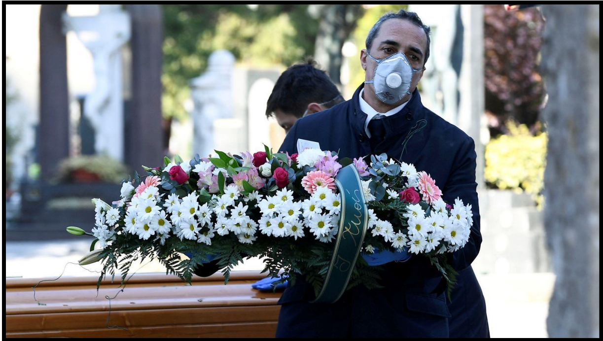
Italy experienced its largest daily increase in coronavirus deaths March 18

Between Trumpism of the late 2020s and Thatcherism and Reaganism of the 1980s, one can visualize the transformation of Neoliberalism as catchall for anything that smacks of deregulation, liberalization, privatization, or fiscal austerity. Neoliberalism has derived from several notions, which are supposedly grounded in the concept of homo economicus , the perfectly rational human being, found in many economic theories, who always pursues his own self-interest. (22) The term had existed in French "néo-libéralisme", and appeared in 1898 in the works of the French economist Charles Gide to describe the economic beliefs of the Italian economist Maffeo Pantaleoni. 'Neoliberalism' also gained momentum in an international intellectual gathering, " Colloque Walter Lippmann " (the Walter Lippmann Colloquium), convened by French philosopher Louis Rougier in Paris in 1938. Lippman was an American journalist who wrote a well-read book " An Enquiry into the Principles of the Good Society " in 1937. The Colloquium's objective was to construct a new liberalism as a rejection of collectivism, socialism, and laissez-faire liberalism. It defined 'neoliberalism' as involving the priority of "the price mechanism, free enterprise, the system of competition, and a strong and impartial state." (23)