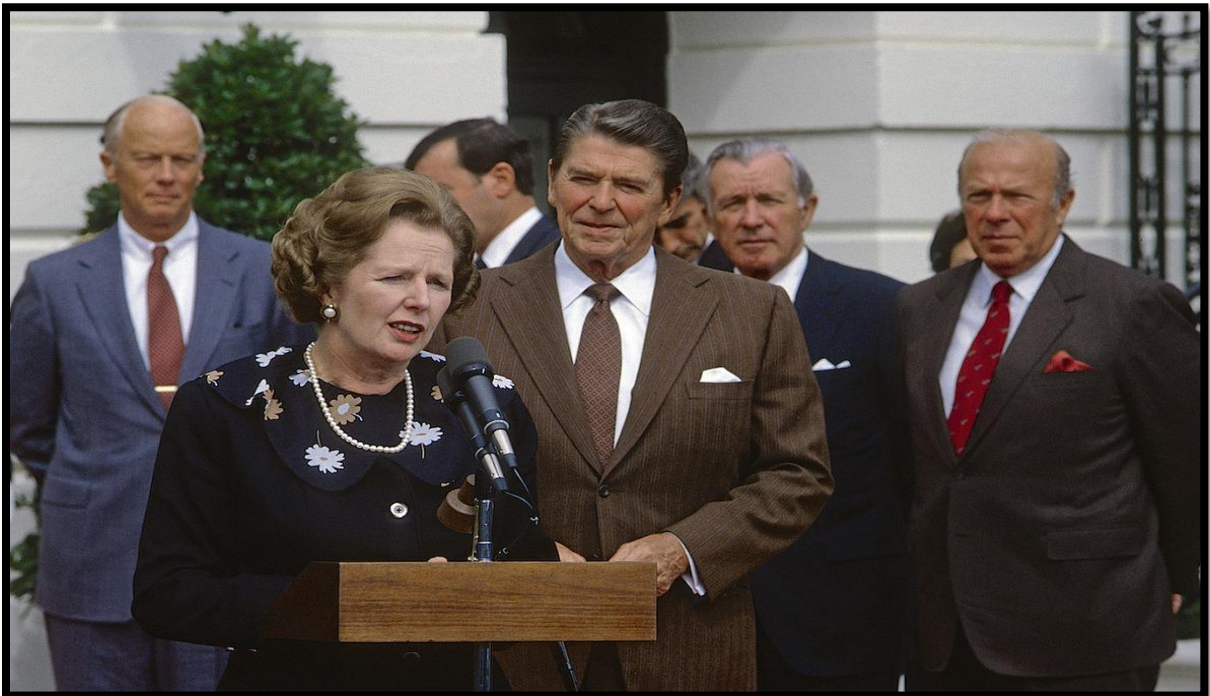
British PM Margaret Thatcher and US President Ronald Reagan at the White House

From a ‘normative’ perspective, Neoliberalism may claim principles of free enterprise and equal opportunity in the market, and potential prosperity as the ‘natural’ law of the market. It has developed itself into what amount to right-wing postmodernism. John Horgan, author of the book “The End of Science” , recalls when postmodernism was popular with left-wing, counter-culture types, who associated science with capitalism, militarism and other bad isms in the 1960s and 1970s. But, as he said, “over the past few decades, extreme postmodernism—and especially the idea that all claims reflect the interests of the claimer-- has become even more popular among those on the right.” (34)