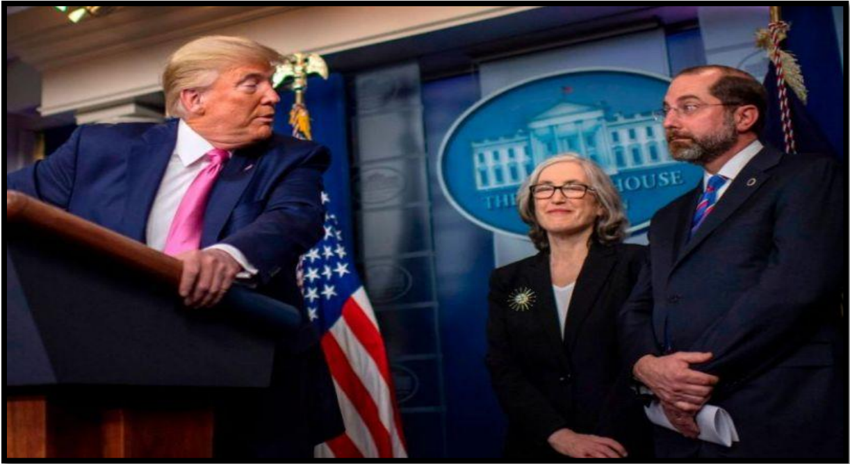
President Trump and Health and Human Services Secretary Alex Azar at the White House

“unaccountable transnational corporations. Services were outsourced; the market left in charge. This development has proved a dangerous one, as it has reduced government’s ability to respond to the needs of its electorate. The resultant disempowerment, as subsequently felt by the people, has in many cases led to disenfranchisement.” (43) Once again, the upper hand of corporate America and its multinationals allies is poised to benefit from the upcoming Coronavirus vaccine revenues.