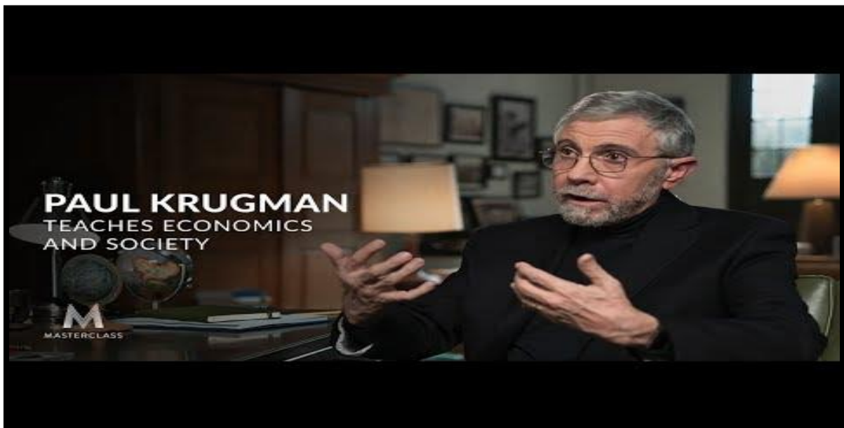
Nobel laureate Paul Krugman teaches a new class Economics and Society online

series of MasterClass lessons “ Economics and Society ” online with an initial subscription of $15. He aims to teaching individuals the principles that shape political and social issues, including access to health care, the tax debate, globalization, and political polarization. He argues economics is not a set of answers—“it’s a way of understanding the world”.