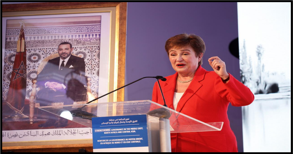
IMF Managing Director Kristalina Georgieva speaks during a news conference in Rabat, Morocco