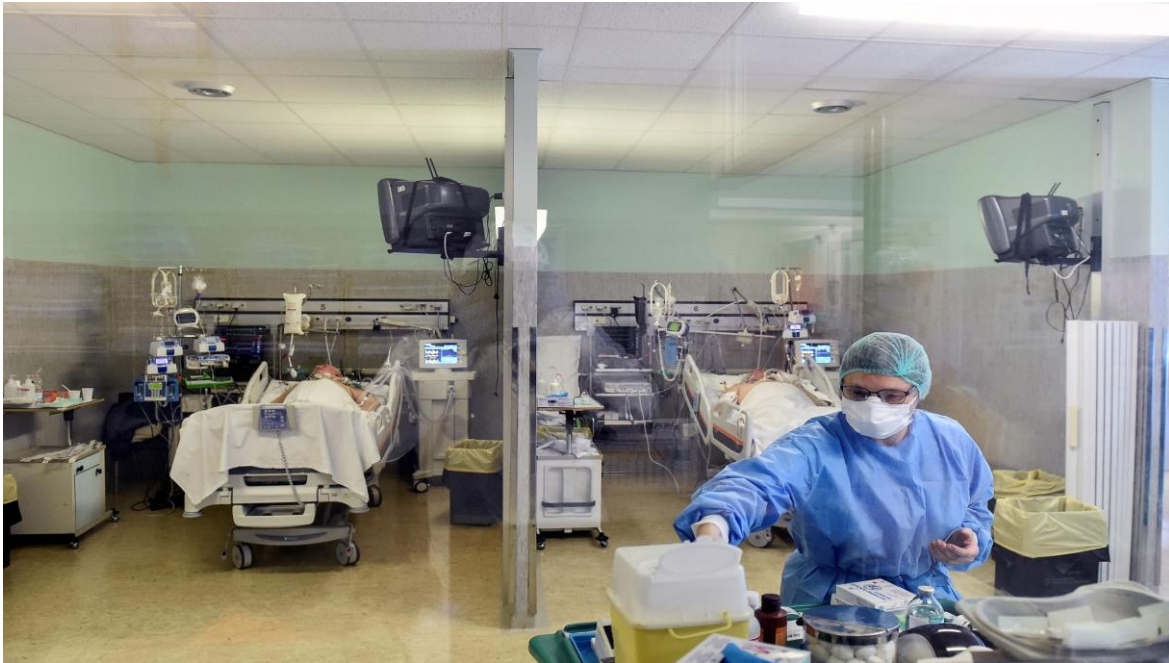
Terrible decisions have to be made when hospitals are overwhelmed in Italy

European economic historians fear some déjà vu memories of the Black Death, which spread in the continent in the mid-14 th century and led to the death of one third of the population. This reduction of demography caused scarcity of labor, increase in wages, decrease in inequality, and contested the then-feudal system in Europe. It also paved the way for the Industrial Revolution which Industrial Britain was hit by 'King Cholera' in 1831-32, 1848-49, 1854 and 1867. Tuberculosis also was responsible for the death of one-third of the casualties in Britain between 1800 and 1850. This nightmarish refrain comes back now stronger as epidemics have been 'great equalizers', and may initiate long-term implications not only for European economic growth, but also for the world economy. After the US Federal Reserve decided to slash the benchmark interest rate to between zero and 0.25 percent (down from a range of 1 to 1.25 percent) and to buy $700 billion in Treasury bonds and mortgage-backed securities in a Sunday emergency meeting, the Dow Jones industrial average plunged 2,250 points at the open and trading suspended almost immediately the following day Monday, March 16.