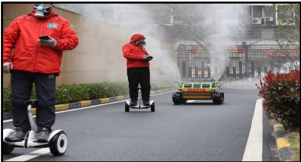
Workers ride smart self-balancing scooters as they control a robotic sprayer spraying disinfectant at a residential compound in Wuhan, China [March 3]

By mid-March, China was claiming victory. “Mass quarantines, a halt to travel, and a complete shutdown of most daily life nationwide were credited with having stemmed the tide”, and “China’s signature strength, efficiency and speed in this fight has been widely acclaimed”, declared China’s Foreign Ministry spokesman Zhao Lijian. (18) One of the op-eds published by China’s state-run Xinhua news agency emphasized that China has adopted the “most comprehensive, most strict and most thorough preventative measures” to combat the pandemic. With a nationalist tone, the People’s Daily boasted that, “China can pull together the imagination and courage needed to handle the virus, while the US struggles.” Chinese officials seized the European and American Coronavirus stress to regularly remind a global audience of the superiority of Chinese efforts and criticizing the “irresponsibility and incompetence” of the “so-called political elite in Washington,” as the state-run Xinhua news agency put it in an editorial. (19)