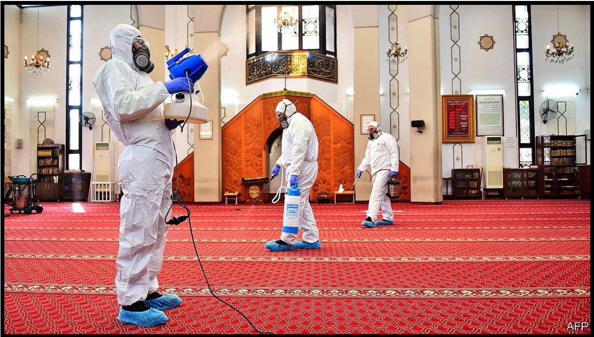
A mosque in Kuwait under a deep sanitizing process

The world’s struggle with Coronavirus can be a reflective and defining moment in modern history. Do we have a public health safety net? How the have-nots are coping with Coronavirus? Do we have an epidemic deterrence strategy since Great Powers have gone to extremes to develop their nuclear deterrence capabilities since World War II? In the fight against Coronavirus, Americans too are currently becoming collateral damage. The Trump administration is reported to be “particularly ill-prepared for such an undertaking. Not only were they distrustful of elite warnings, thanks to decades of conservative attacks on the American intellectual establishment, but the president was personally unwilling to believe news that might be politically damaging and surrounded by a staff too scared or too incompetent to convince him otherwise. They ignored the advice of public health experts warning them to ramp up testing, ignored warnings from doctors on the ground that things were getting bad, and failed to tell Americans that social distancing was necessary before it was (arguably) too late.” (52)