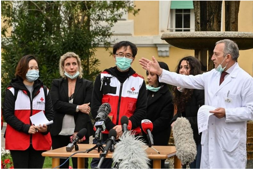
China sent to Italy a team of nine Chinese medical staff along with some 30 tons of equipment on a flight organized by the Chinese Red Cross March 12

WHO Director-General Tedros Adhanom has been particularly criticized for having uncritically repeated information provided by the Chinese government, initially opposed any restriction to air traffic to and from China and delayed the decision to declare COVID-19 both a “public health emergency of international concern” (until January 30) and a “pandemic” (until March 11), not to mention his constant ostracism of Taiwan, which is not a UN member because of China’s opposition.(40) In other words, for many around the world, the WHO also bears some responsibilities in the spread of this epidemic. While President Trump’s threat made in mid-April to stop funding the WHO may be temporary, the WHO’s pro-China bias is likely to put this organization under closer scrutiny in the coming years.