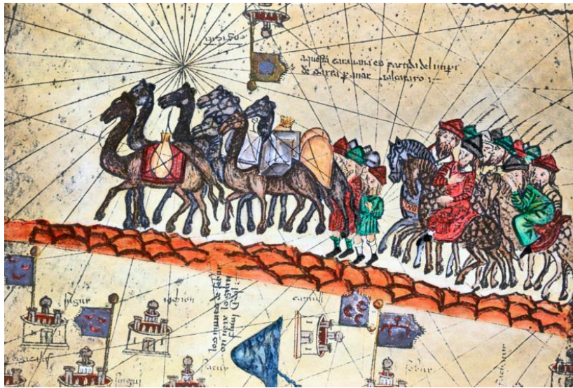
A 14th-century painting showing the caravan of Niccolò and Maffeo Polo crossing Asia

not only to dividing the EU along already existing fault lines – the member-states most critical towards the EU are the ones which have joined China’s Belt and Road Initiative (BRI) – but to highlighting the EU’s unpreparedness and disorganization.