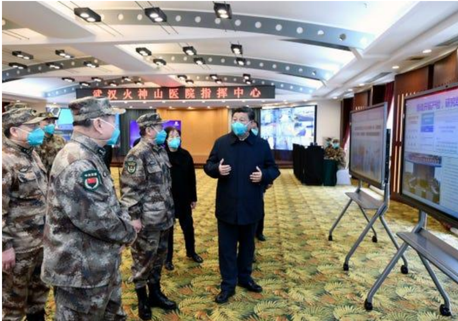
Chinese president XI assesses the victory against the spread of coronavirus