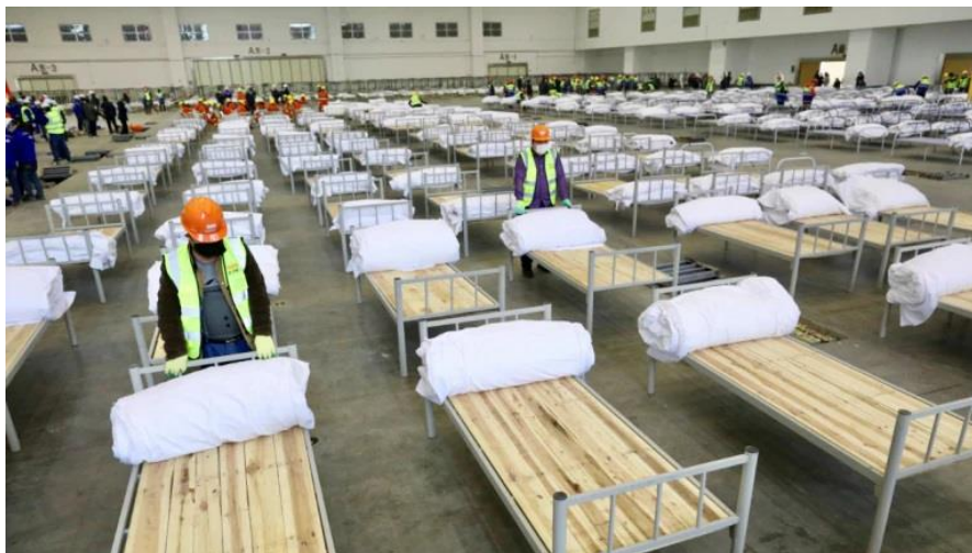
Workers setting up beds at the Wuhan Parlor Convention Center to convert it into a makeshift hospital February 4 2020

While after mobilization was decided the Coronavirus was rapidly contained thanks to strict confinement measure and a complete lockdown of Hubei province, the Chinese government was compelled to address the double pressure from the medical community and the public for more accountability and transparency. Actually, in early February 2020, the CCP leadership, and especially President Xi, faced a genuine “crisis of governance”. (15) Local authorities had hidden the truth about the virus from both the central government and the WHO. In spite of censorship, Chinese social media were overflowed with messages criticizing the government and asking it for more transparency. President Xi Jinping was especially singled out for not having led the battle against the virus himself and earlier. Chinese internet users have also raised doubts about official statistics regarding the number of COVID-19 cases and deaths, suggesting that the total numbers should be around three times higher than the governmental reports indicated. Adding to these doubts, the authorities recognized that they had left asymptomatic cases outside of the data, (16) deciding only in late March to include them. (17) Nonetheless, this decision has not put an end to the controversy, owing to the logistical difficulties to conduct tests, and because more than two third of the new cases have no symptoms. (18) Outside of China, some analysts estimate the number of cases to 2.9 million instead of around 83,000. (19)