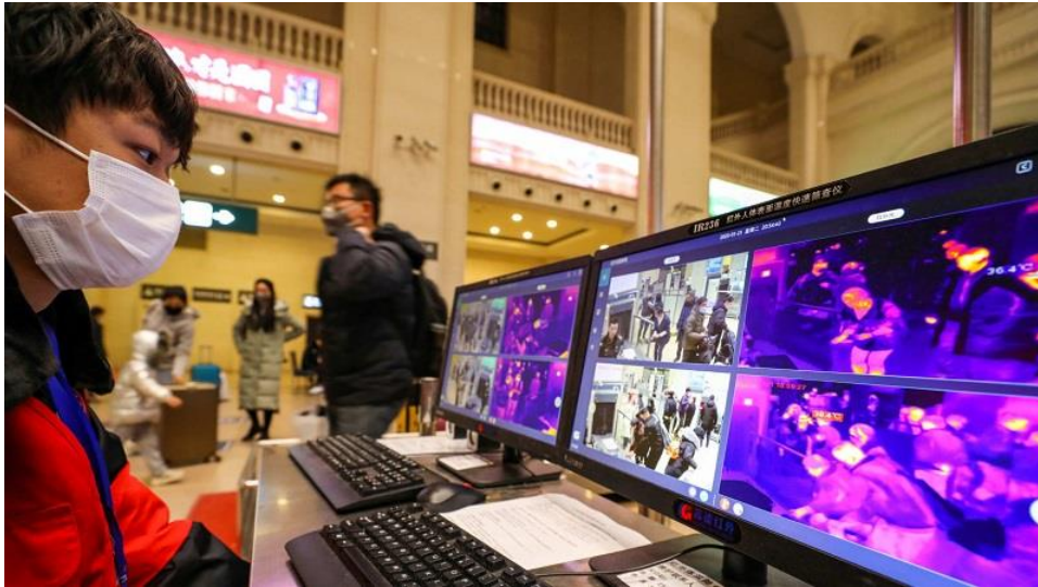
Health measure in Hong Kong

One of the most direct consequences of the current pandemic is likely to be a reassessment in many countries of their dependence upon China and not only in terms of medical equipment and pharmaceutical products, and affect their supply chains. (51) More generally, COVID-19 has already revived the debate about decoupling in the US and strengthened the arguments made by the politicians, particularly in Europe and the Global North, favoring de-globalization. Although a full Sino-American economic decoupling is not only unlikely but also impossible, in sensitive sectors, as high-tech, it will probably speed up. Moreover, the pandemic has clearly highlighted the risks attached to one-sided dependence and intense connectivity.