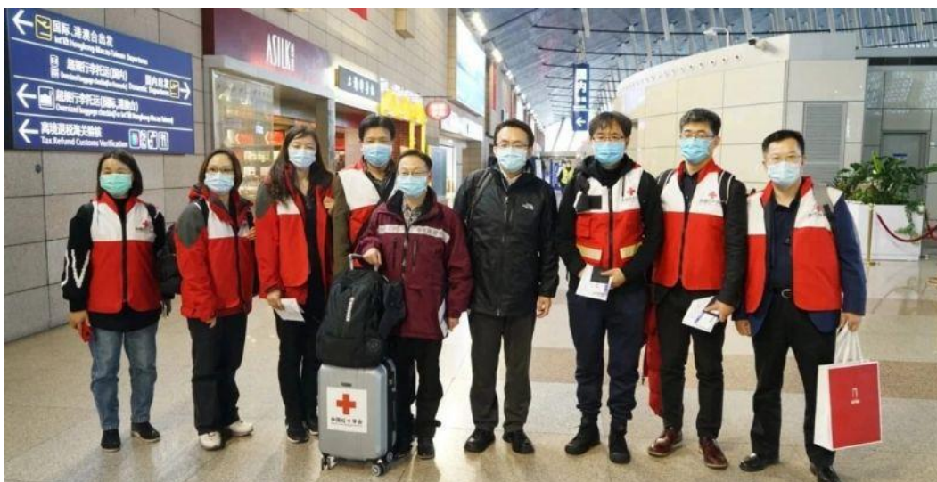
China sends medical experts and hospital equipment to help in Italy's Coronavirus emergency March 12 (Reuters)

Even Italy's divided political elite had mixed feelings about China's assistance. The Italian Minister of Foreign Affairs, Luigi Di Maio, actively welcomed Beijing's new "health Silk Road" because he was the architect of Italy's BRI MOU, favors Huawei for his country's 5G and his party, the Five Star Movement (FSM), is openly pro-China. But other members of the government have kept their distance from this country.(31)