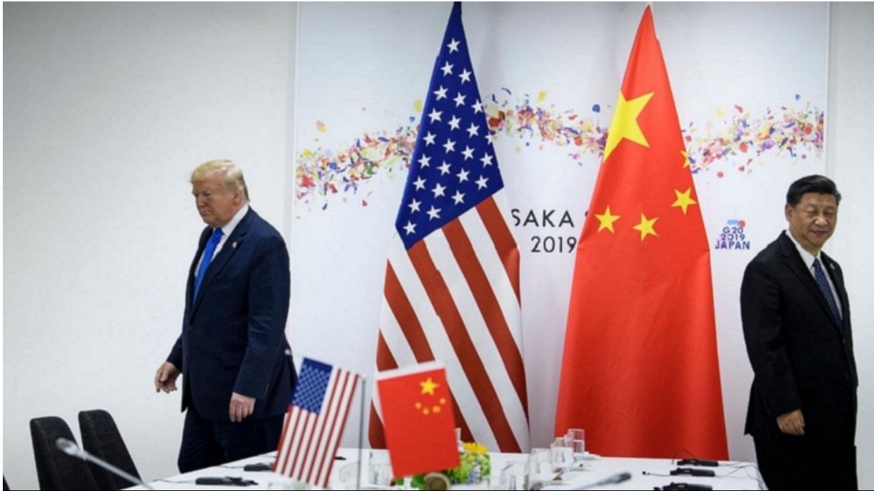
Trump and Xi

Originated from Wuhan, the current Coronavirus pandemic, known as COVID-19, is a good illustration of how the Chinese government has tried to grasp an unprecedented health crisis not only to demonstrate its capacity to rapidly overcome it but also to enhance its diplomatic influence, improve its international image and challenge the US dominant status both as a leading health care provider and a world role model. Has China succeeded? Taking advantage of its close relationship with the World Health Organization (WHO), the Trump Administration's late mobilization against this novel coronavirus, the European Union (EU)'s disorganization and divisions, as well as each country's preoccupation with its own domestic health crisis, China has achieved early successes on the international stage, particularly in Eastern and Southern Europe as well as in the Global South. Nonetheless, the Chinese government's initial failure in the management of the health crisis at home as well as the aggressiveness and incoherence of its own narrative have contributed to denting the credibility of its own data and its "politics of generosity".