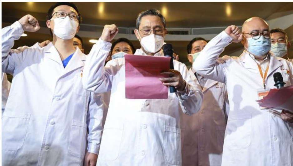
Chinese experts including Zhong Nanshan (middle) denying any evidence that Wuhan was the source of the Coronavirus spread

In the shorter-term future, the Chinese Communist Party (CCP) will need to focus on the challenges it is facing at home, contain COVID-19 second wave, resume economic activities, and reassure the society about its initial failures in the management of the health crisis. China will also have to face and handle a relationship with the US and its allies both in Europe and Asia which have become much more delicate because of the aggressiveness and incoherence of its own narrative, not only about the pandemic but also Western countries' political system and the world order.