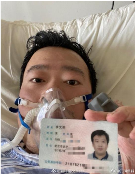
Whistleblower Doctor Li Wenliang dies of Coronavirus after he was punished for spreading 'false rumors' by Chinese authorities

We now know that some Chinese medical doctors, as Li Wenliang, had alerted the public about the dangers of this new zoonotic virus but were then silenced and reprimanded. We also know that many medical staff complained about the lack of masks and other personal protective equipment (PPE), and that segments of the society criticized the government for its censorship of the whistle-blowers and its late mobilization against the virus. But the Chinese authorities have been able to swiftly mend their image in addressing some of the domestic complains and in propagating a powerful international narrative aimed at demonstrating their political system’s capacity to rapidly contain and overcome the COVID-19 epidemic and this, better than and ahead of the rest of the world.