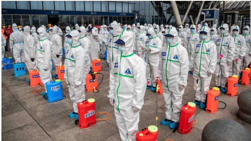
Staff members line up as they prepare to disinfect Wuhan Railway Station March 24

mankind". But COVID-19 has shown on the contrary that large parts of the world do not wish to share the same future as the Chinese communists.