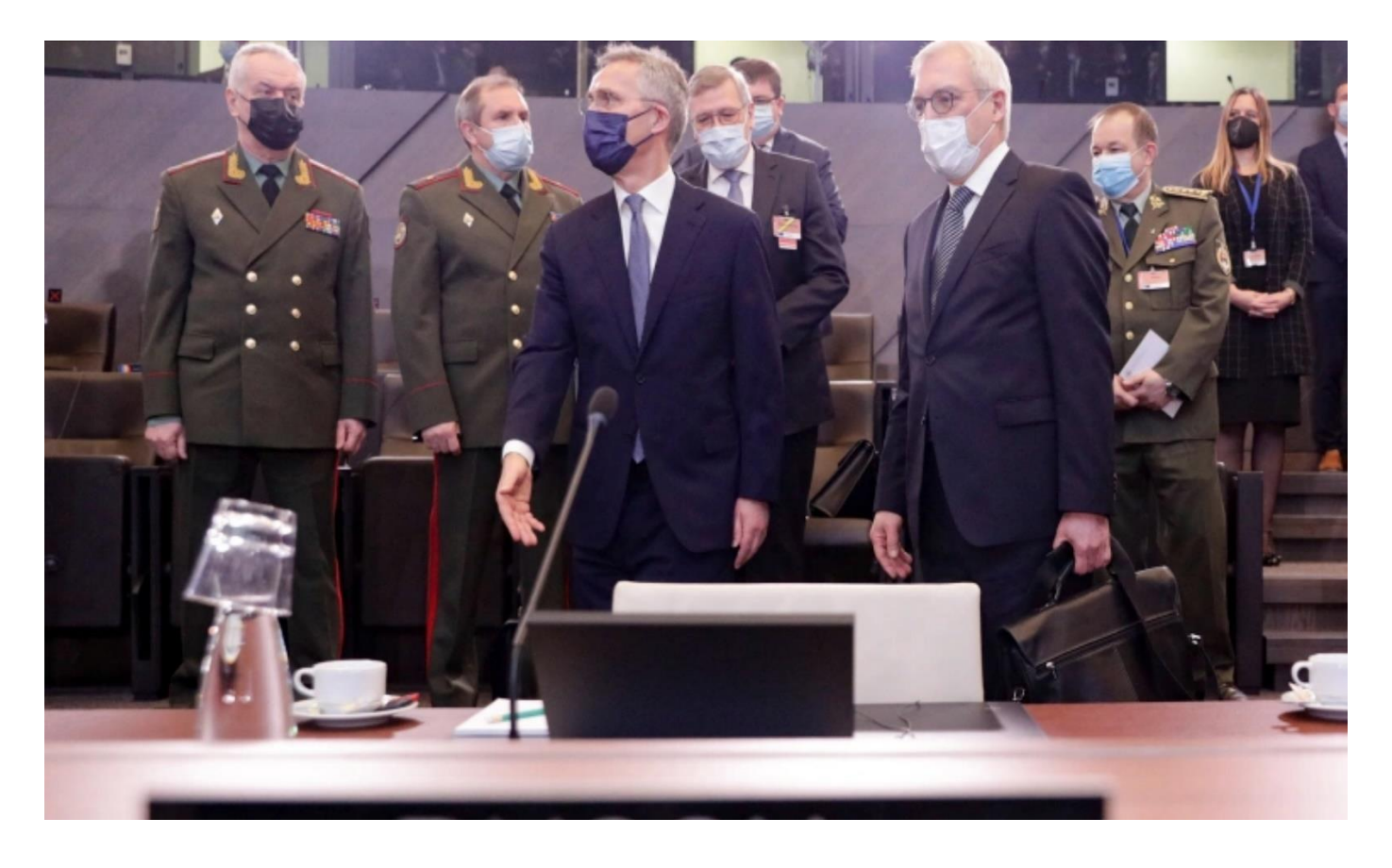
The Russia-NATO metaconflict seems to blend traditional and innovative mechanisms of war and subordination of political economy to realpolitik.

The aftermath of the Ukraine war, as a protracted complex conflict, has revealed how the Russia-West geopolitical rivalry has entered uncharted territories with an asymmetrical war and unparallel weaponry: hard power versus sanctions and other tools of political economy, or sticky power. It seems to be a misguided venture of power dynamics: bullets and rockets versus economic and financial warfare, perpetuating a long hurting stalemate for all stakeholders. This paper addresses how the standoff between Putin's Russia and Western powers may amount to a new geopolitical paradigm shift and raises questions about the validity of certain conceptual frameworks: the renewal of 'the Cold War', the imposition of a 'New World Order', and the (im)balance of an assumed 'Balance of Power'. These post-World War II mechanics of Détente were prolonged, after the fall of the Berlin Wall in 1989 and the dissolution of the Soviet Union in 1991, into the 21st century. The 'post' prefix endures the challenge of forecasting what would come after a three-decade prolongation of several concepts ushering to several unknowns of the Ukraine war postgame.