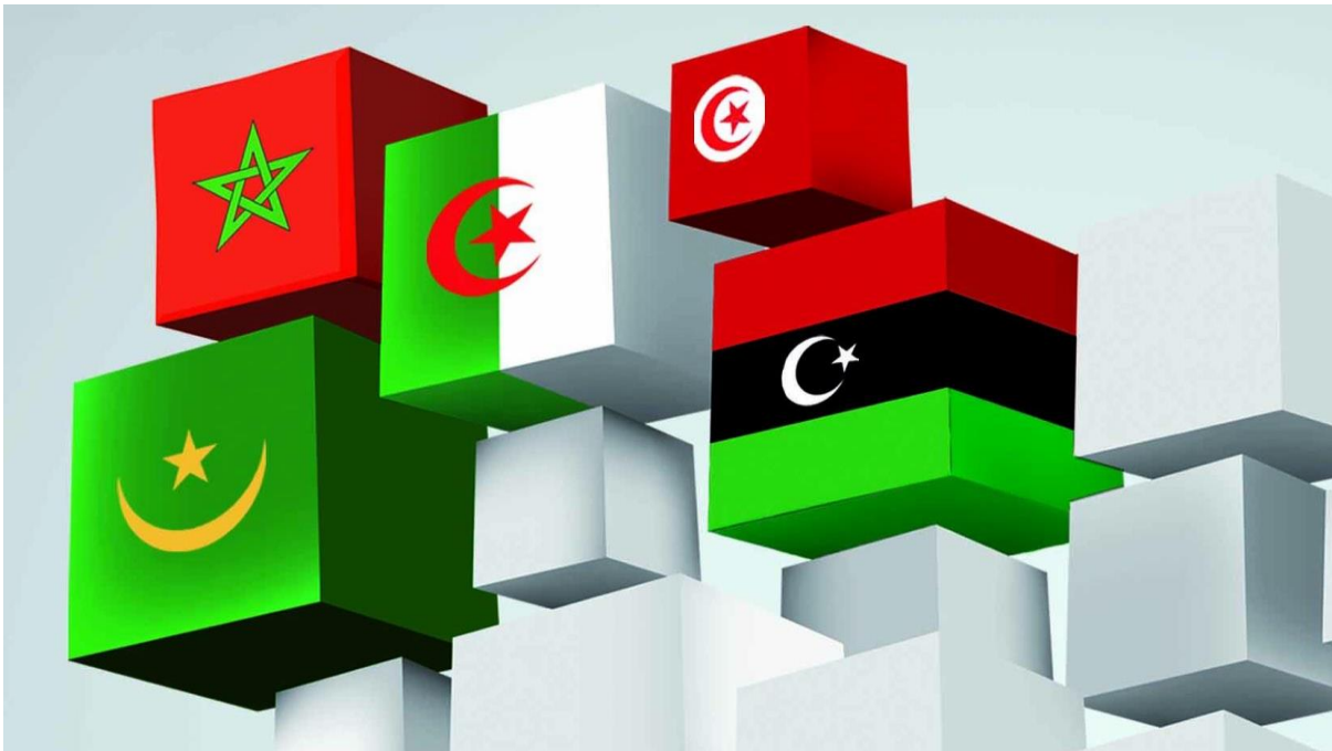
Maghrebi Flags