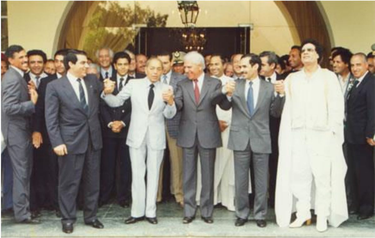
North African Leaders during the Maghreb Union summit, February 1, 1989