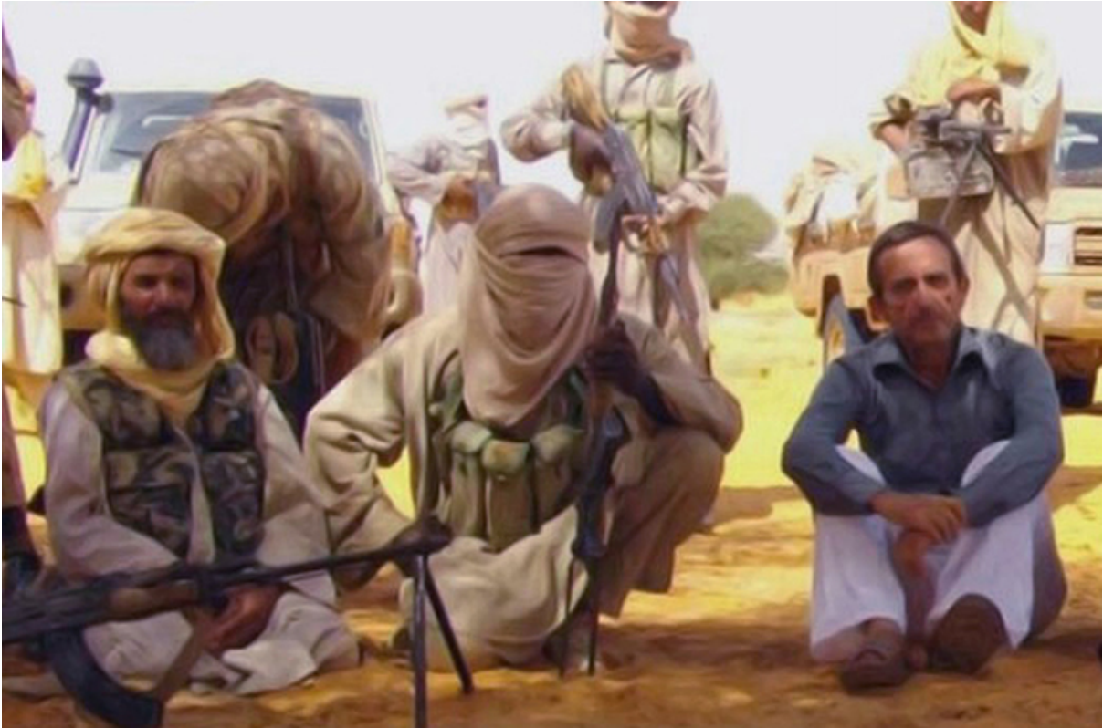
A foreign hostage was among seven seized in Niger by an al-Qaida offshoot, according to a group that monitors terrorism. [AP]