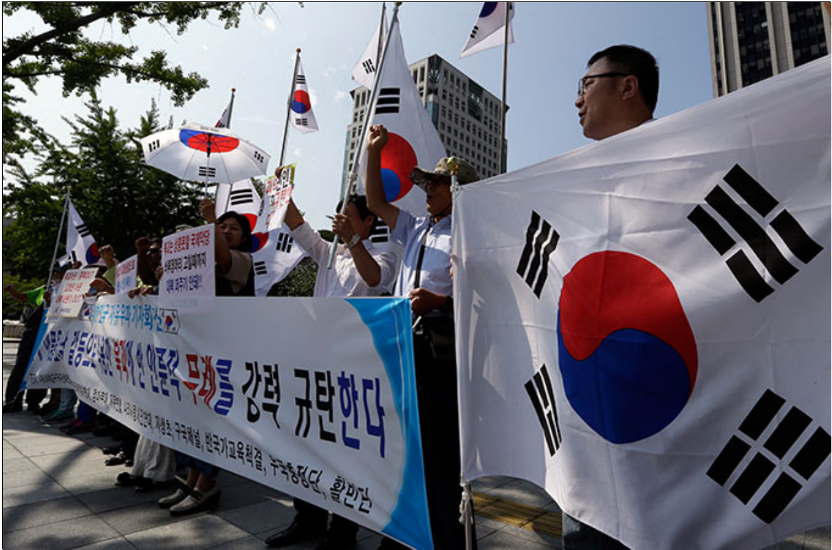
South Korean protesters shout slogans as they hold national flags during a press conference against abrupt cancellation by North Korea of planned reunions for families separated by the Korean War in front of the government complex in Seoul