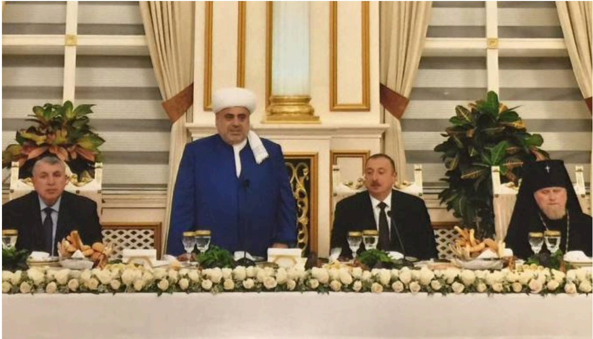
Azerbaijan presents a model of coexistence among adherents of various faiths

Further, in what could be described as a “religious ideology”, religious institutions in Azerbaijan have been trying to build a religious model that reduces differences between Shia and Sunni. This has resulted in firm policies against preachers from abroad in order to maintain what is described as “a unique peaceful coexistence among Islamic branches. Azerbaijan may be the only Muslim country in which the followers of two sects pray together in the same mosque, and sometimes even behind the same Imam”. (25) Azerbaijani officials insist on talking about the country as one of peaceful coexistence between representatives of all religions, in addition to national and ethnic minorities, and that this model of tolerance should be encouraged in Europe and throughout the world. (26)