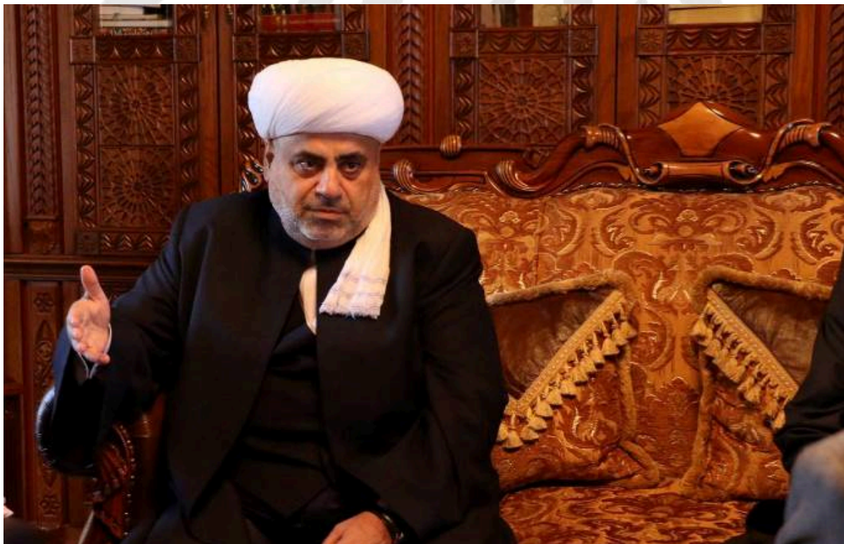
Shaykh Al-Islam of the Caucasus region, Allahshukur Pashazadeh

It is possible to claim that Azerbaijan is one of the most secular Muslim societies, since the constitution clearly articulates the state’s secularism. (15) Apart from that, it was the first Muslim country to introduce theatre and cinema. Today, the regime in Azerbaijan is one of the most secular in the region, leading some to propose that this has seriously limited extremism (16) in a country whose geopolitical significance in the Caucasus region grows daily.