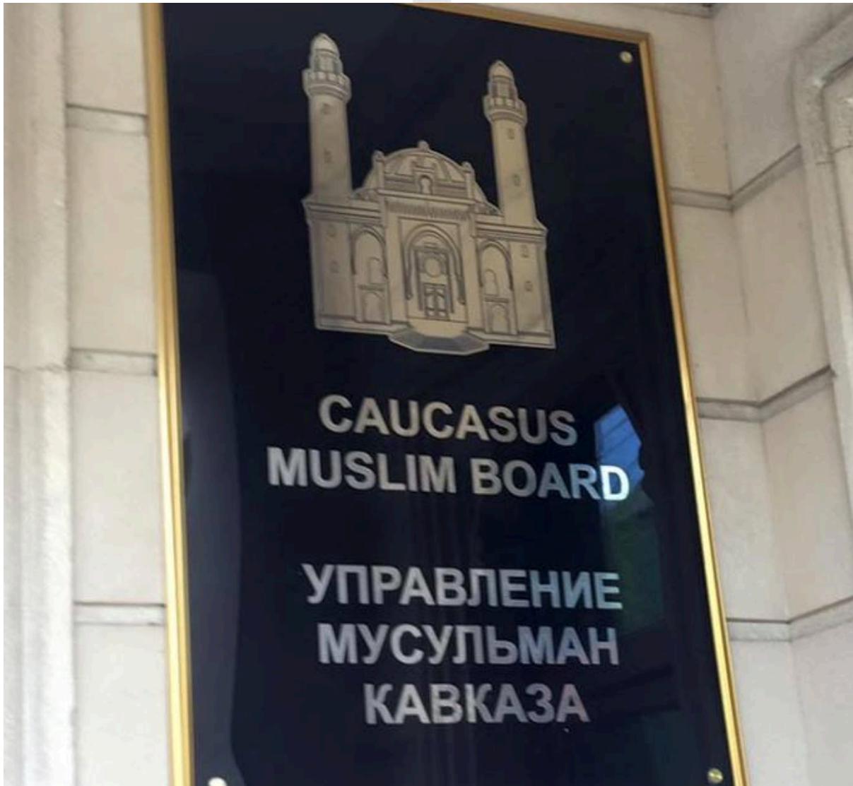
Caucasus Muslim Board, responsible for administering mosques and clerics

After Azerbaijan declared independence, which resulted in a bloody clash with Russia, the number of mosques in Azerbaijan increased noticeably. Several of them were built through the support of Islamic countries such as Iran and Saudi Arabia. This era coincided with the arrival of preachers and the establishment of a religious institute in 1991. However, the conversion of Azerbaijan to a popular destination for preachers had some negative aspects, "as some of them exploited the existing power vacuum and Soviet era effects, with both Sunni and Shia leaders promoting extremist views, something that made their presence unwelcome in Azerbaijan".(10) In response, the Committee for Religious Affairs, mosque managements and the Department of Muslim Affairs in the Caucasus adopted a strict policy on this issue, one that still holds today.(11)