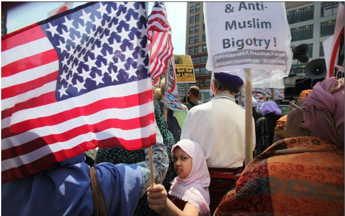
A young Muslim girl waves the American flag ahead of the Presidential elections. [AFP]