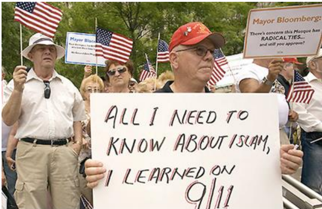
Representation of Islamophobia

Islamophobia has served as a perennial chosen-trauma perpetuated by the conservative media discourse at every occurrence of violence within the 24/7 cycle of coverage and political spin. Under the heavy constructivism of the American reality(s), Islamophobia has incrementally turned into a cultural reservoir for the maintenance of the American exceptionalism. It has provided the needed reciprocity between the protection of American exceptionalism based on its radical and power-driven interpretation among right-wing groups, Evangelist associations and other coalitions in Trump's base on the one hand, and the utility of bashing Islam at this delicate conjuncture between the Christian West and the Islamic East on the other.