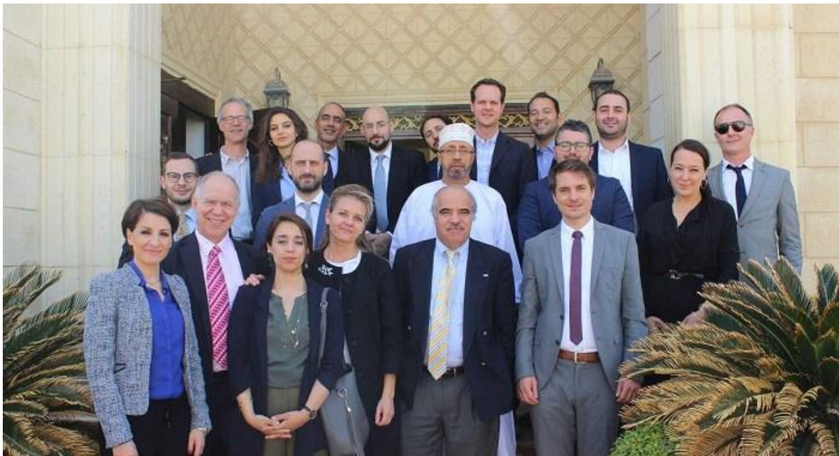
Some of the Participants at the “North Africa: New Elections, Old Problems”. conference hosted by Brookings Doha Center [BDC], the Italian Ministry for Foreign Affairs and International Cooperation [Farnesina] and the Italian Institute for International Relations [ISPI], as part of the “Mediterranean Dialogues” series .