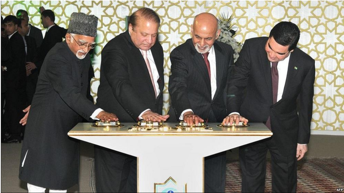
Inauguration of the TAPI Project: (Left to right) Indian Vice President Hamid Ansari, Pakistani Prime Minister Nawaz Sharif, Afghan President Ashraf Ghani, and Turkmen President Gurbanguly Berdimukhammedov December 13, 2015.

India and Pakistan are not the only external powers fighting for influence in Afghanistan, there is also competition for influence between the United States and China, and Russia, between Iran and Pakistan. The agenda of defeating the Taliban has occasionally gone on the back burner amidst the complexity of those rivalries. What has not much recognized, however, is the increasing capability of the Afghan state and its institutions to consolidate and assert its power, something that Afghanistan has not seen in its previous conflicts, mainly in the post-Soviet era. This paper aims at analyzing how the Afghan state is emerging powerful to the extent that the Taliban may not overthrow it violently. Moreover, the politics of consensus has opened new avenues of dialogue that has brought Gulbadin Hikmatyar back from militancy. Pakistan's denial of these developments often reflects in its overstating the role of India in Afghanistan, which is largely development focused.