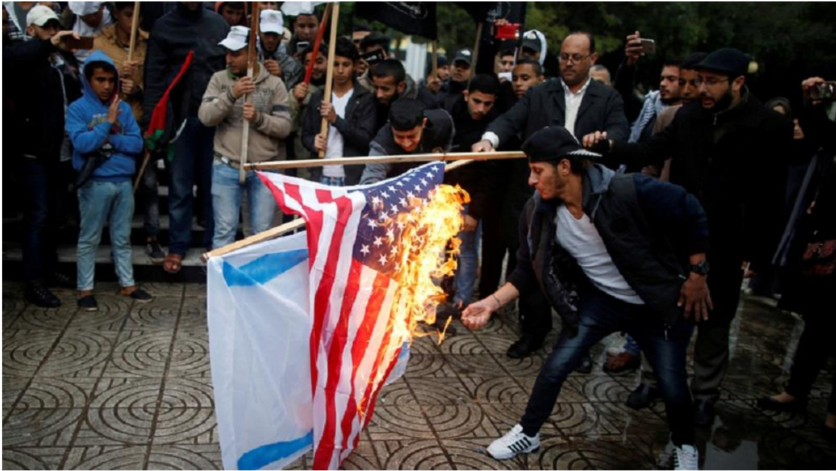
Palestinians burn an Israeli and a U.S. flag while protesting Trump's decision in Gaza City on Dec. 6, 2017

To help capture the nuances of U.S. President Trump's decision to recognize Jerusalem as the capital of Israel and to move the American embassy from Tel Aviv to Jerusalem, one needs to consider politics is not only domestic, but also personal. One overall development that emerged from the emergency meeting of the Security Council was the deepening divergence between the U.S. and European member states. The question remains: who will fill in the shoes of the U.S. as an alternative peace broker in the Middle East.