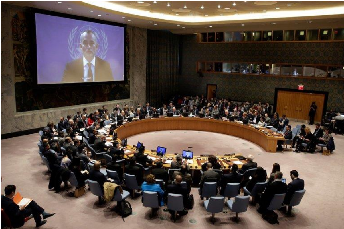
Emergency session of the Security Council in New York Dec. 8, 2017

The somber debate at the Council showcased clear division between two camps: the United States and Israel versus the international community with divergent outlooks of the future of the peace process. U.S. ambassador Nikki Haley approached the diplomatic battle with the notion that the best strategy of defense is attack, and criticized the United Nations saying "it has done much more to damage the prospects for Middle East peace than to advance them." She also charged the world organization of being "one of the world's foremost centers of hostility towards Israel".