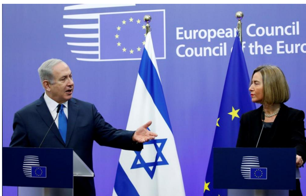
European Union foreign policy chief Federica Mogherini meets Israel's Prime Minister Benjamin Netanyahu at the European Council in Brussels

Security Council resolutions." He also emphasized that Jerusalem's status is to be decided in direct Israeli-Palestinian negotiations, and reminded the White House that Trump's decision "goes against the plea of many friends of the United States and Israel". The most robust opposition to Trump's decision was articulated by Bolivia's ambassador Sacha Sergio Llorenty Solíz. He expressed his concern that "the Security Council will become an occupied territory." After the emergency meeting, ambassadors of the United Kingdom, France, Sweden, Germany, and Italy issued a joint statement outside the Council's chambers condemning the American position, saying it was "not in line with Security Council resolutions and was unhelpful in terms of prospects for peace in the region." (17) For the same reason, United Nations Secretary General António Guterres made it clear that "in this moment of great anxiety, there is no alternative to the two-state solution. There is no Plan B."